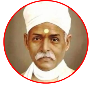
Madan Mohan Malaviya